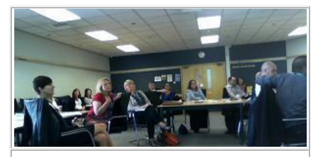
Participants at a KM Framework Audit workshop

Contact Knoco to learn more about the KM Framework assessment audit